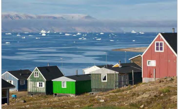
Coastal town in Greenland