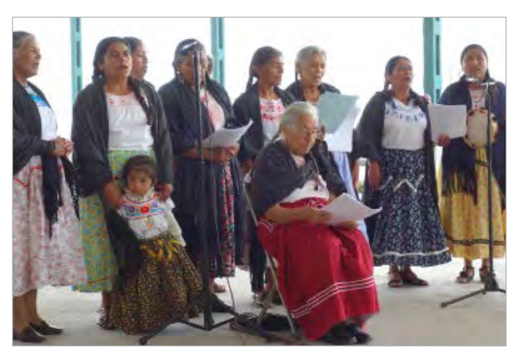
Totontepec women's choir, performing bilingual songs in Spanish and Ayöök