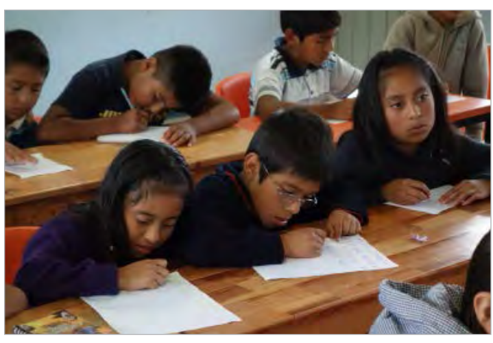
Totontepecano children learning to write Ayöök