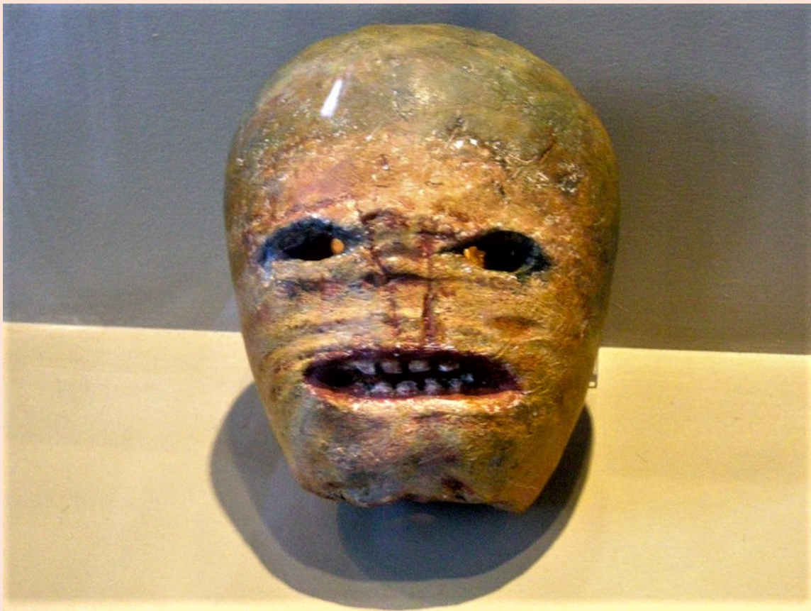
Carved Turnip, Celtic practice for Samhain-- National Museum of Ireland